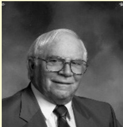
WILLIAM MOREHOUSE SCHOLARSHIP

This scholarship supports students pursuing careers in residential construction, including those enrolled in community college programs, trade schools, certificate programs, apprenticeships, and workforce training programs.